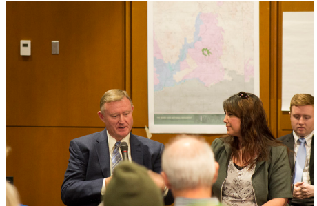
Senator Evan Vickers